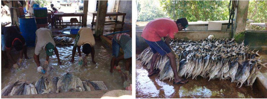
Figure 9. Washing off excess salt (Left) and draining the fish before sun drying (Right).