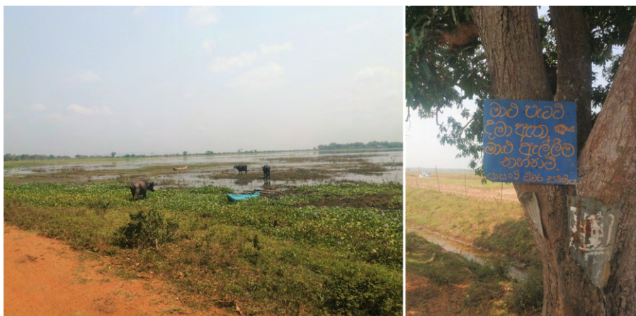
Figure 15. A shallow lake (Left) and a displayed notice that reads “Fingerlings have been stocked. Fishing is prohibited. – Section 9 Fisheries Association”.