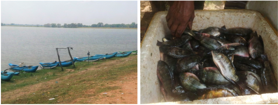
Figure 14. A traditional fish landing site at the lake and cultured fish.