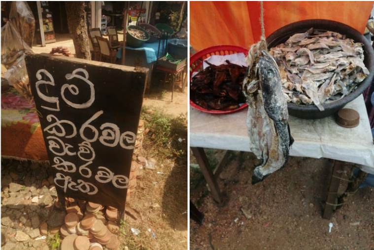
Figure 18. A roadside stall with a sign that reads “Smoked fish freshwater dried fish available”.

Processors generally attempt to sell their dried fish stocks within a period of two weeks, as dried fish absorbs moisture from the air, especially during rainy weather. The prices are determined based on the size of the dried fish, with smaller fish fetching about CAD 2.24/kg (= LKR 350) and larger fish CAD 3.20/kg (= LKR 500).