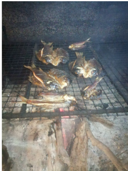
Figure 17. Artisanal smoking.