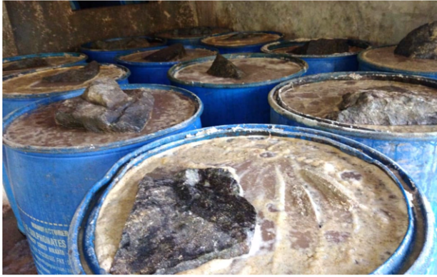
Figure 8. Salting barrels.

operations) for a period of two days to a week depending on the weather and the availability of drying space. Barrels are often tightened with the lid or using a polyethene cover to protect from fly infestations. Lid-less barrels are also often seen with a heavy rock placed on top of fish to ensure that the fish is submerged in salt water as salt also acts as a fly repellent (Figure 8).