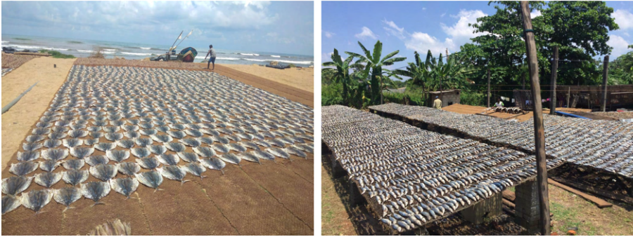
Figure 10. Sun drying using coir mats (Left) and drying racks (Right).