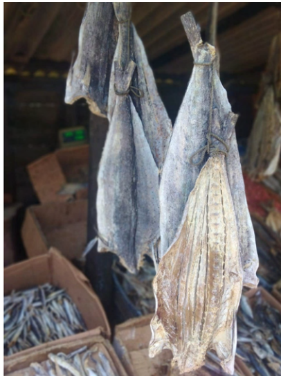
Figure 5: Boat dried fish.

A much smaller quantity of fish, 200-500 kg/boat, is also fully processed at sea (cleaned, salted, and dried) and landed by the offshore fishing vessels. Boat dried fish, referred to as 'bottu karawala', is popular among locals for its unique taste, texture, and perceived high quality. Upon arrival, it is customary that the boat owners share several of these bags among crew members as a gift in appreciation of labour at sea during the long fishing trips.