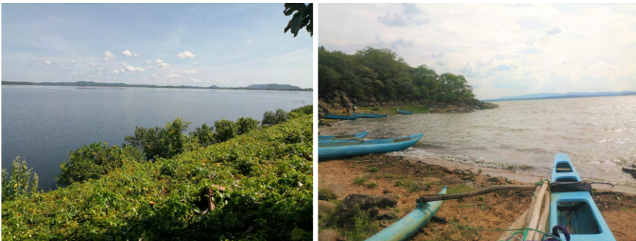
Figure 13. Kantale reservoir and traditional fishing canoes.

boat with an outrigger (Figure 13). Gill nets (4") are used in the reservoir and in the perennial culture-based lakes. Some fishers use a separate net with smaller mesh size (1 1/3") called 'Karawala dela or Binthul dela' to target wild varieties for drying. Each canoe typically lands about 10-15 kg of fish each day, although the catch amounts generally fluctuate seasonally and due to overfishing. Once landed, larger fish are sold to fresh fish sellers. Generally, juveniles of relatively large fish varieties (e.g., carp, stinging catfish) or smaller fish varieties (pearl spot cichlid) are used to produce dried fish. Cold storage in post-harvest handling is minimal and is limited to Styrofoam boxes that sometimes contain homemade ice. Prices vary by the size of fish (small fish vs. big fish) and not the variety.