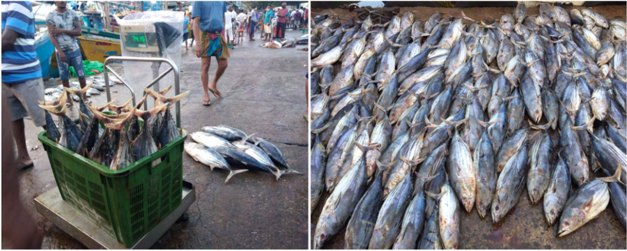
Figure 3. Skipjack tuna stocks sold for dried fish making.

day for drying in nearby sites at a rate around CAD 2.25/kg (=LKR 350/kg). 24 These transactions happen largely based on credit relations underpinned by local networks of contact and trust relations, although some processors prefer to buy with cash.