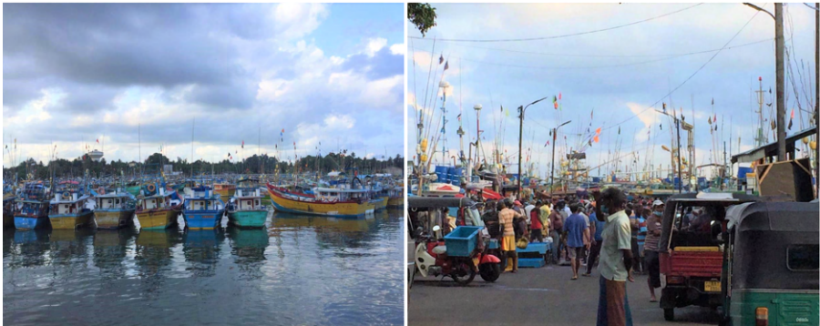
Figure 2. Multi-day fishing vessels (Left) and the entrance to the auction at the fishing harbour (Right).

Fish landed at the harbour are caught by multi-day fishing vessels (30"-45" in length with capacity for ice storage) in offshore fishing trips that last about 30-40 days. The types of gear used are gill nets, long lines, and coarse nets (local name for small purse seines targeting schooling fish such as Indian scad). About 15 multi-day vessels land in the harbour each day. Each boat lands a catch volume of about 12,000-15,000 kg during each trip, however, these catches are typically considered of lower quality due to the longer duration of preservation in ice. Smaller vessels (28" in length) also land at the harbour. These vessels are used for 5-6 days fishing trips within the country's territorial waters and these catches are considered fresh.