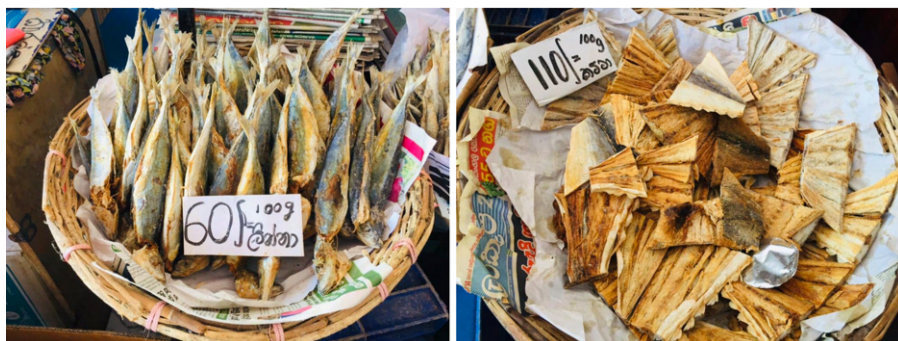
Figure 7. Large dried fish sold as pieces (Left) and small dried fish sold as the whole fish (Right).

Large excess fish harvests from other areas, such as the Southern areas of Galle, Kudawella, Tangalle, and Mirissa, and sometimes also from Western areas such as Negombo, are purchased by the processors using established contacts. The fishers then arrange the transportation of these fish stocks by lorries directly to the drying sites in Kalutara area. The size of these stocks can go up to 5,000 kg per lorry.