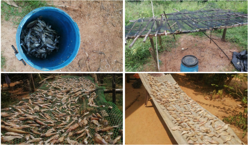
Figure 16. Sun drying on simple structures and roofing metal sheets.