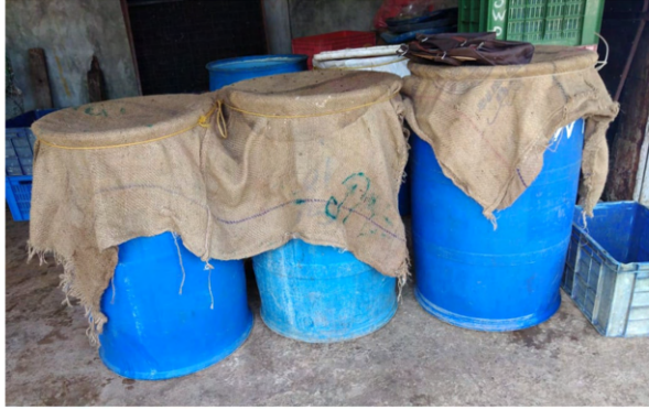
Figure 4. Barrels of partially processed fish.