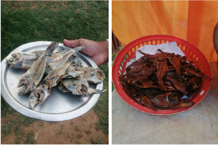
Figure 19. Salted-sun-dried fish and smoked fish.

stores with which they have long-standing trade relations.