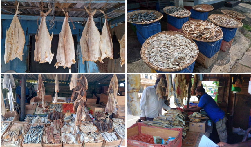
Figure 11. Roadside dried fish stalls in Beruwala.