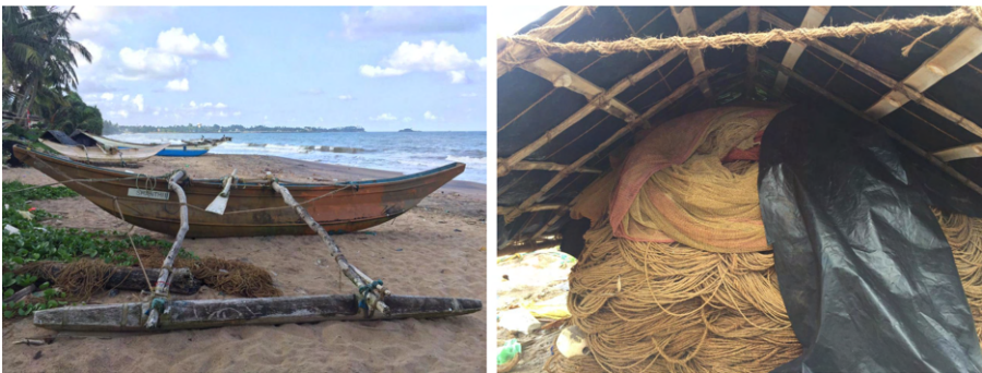
Figure 6. Traditional boat landing (Left) and a beach seine stored away during off-season (Right).

The Kalutara area is also known for its intergenerational seasonal beach seine fishery that operates from around October to March (Figure 6). Fish availability during the season largely depends on the rhythms of the sea. Calmer and shallower coastal waters (locally referred to as ‘walaala muhuda’) are considered ideal for this fishery. However, the number of beach seines in operation has drastically reduced over the past few years: from 135 in 2016 to 40 in 2019 (Fisheries Statistics, 2019). Beach seines target smaller pelagic fish such as anchovies and sardinella, which are very popular among locals in dried form. According to fishers, the sharing of common beach space between fish drying people and beach seine fishers is governed by local traditional practices, which give priority to the beach seine when in operation.